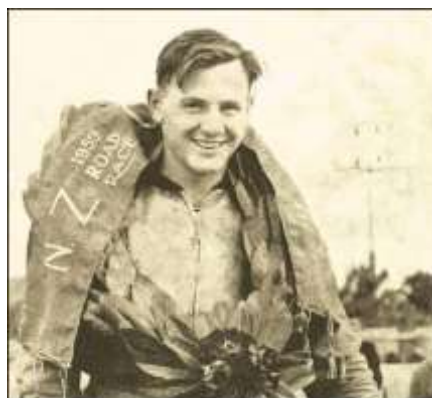
Bruce McLaren (1937-1970), a race-driver, the founder of the famous Formula-1 team.