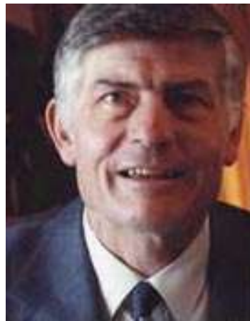
Colin Murdoch (born 1929), a pharmacist, the inventor of the single use plastic syringe (1956).