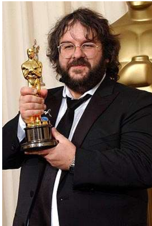
Peter Jackson (born 1961), a film director, a script writer and a producer; famous for his film “The Lord of the Rings”.