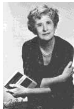
Ngaio Marsh (1895-1982) a detective fiction writer