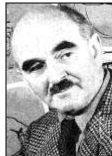
David Low (1891-1963) a political cartoonist