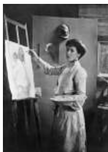
Frances Hodgkins (1869-1947) an abstract painter