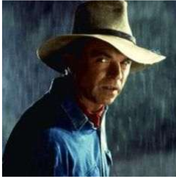
Sam Neill (born 1947), a film actor and director. His most famous work is the role of doctor Alan Grant in “Jurassic Park”.