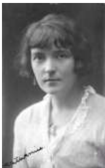
Katherine Mansfield (1888-1923) a world famous writer