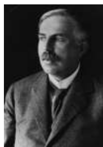
Ernest Rutherford (1871-1937), a physicist-experimenter, the founder of nuclear physics